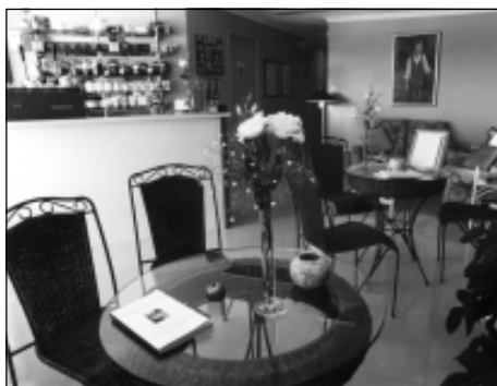
A view of Paddi's 'Big' coffee lounge as you are greeted at the door.

Often, dental offices run behind time because another customer (usually a D customer) shows up late, and it com-